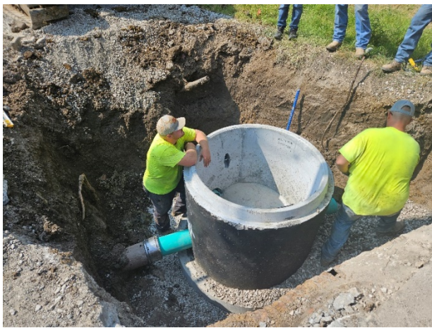
Manhole placement at 4th Street

The water improvements phase of the project has been completed. Currently, the contractor is focused on sewer replacement, and once that is finished, they will proceed with the stormwater infrastructure work.